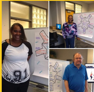
New Santa Fe SAINTS students