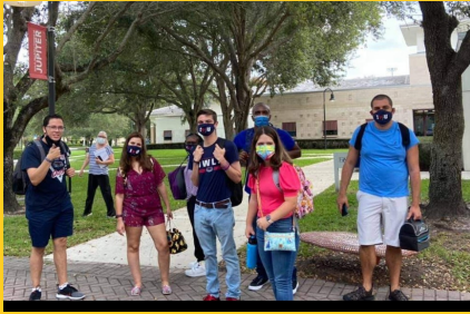
New FAU ACI students