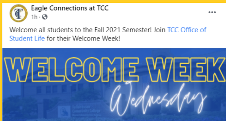
Eagle Connections at TCC invite students to Student Life Office for their Welcome Week