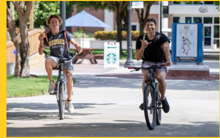
New IRSC Project STAGE students arrive on campus