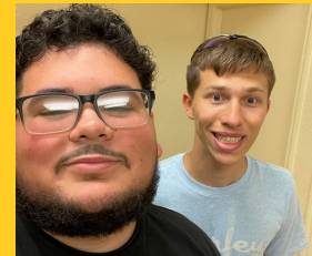
New roommates at SEU LINK Program